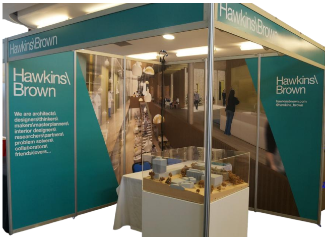
EXAMPLE IMAGE OF INSERTED GRAPHICS INSTALLED IN A 3M X 3M OPEN ENDED STAND.

Please note we do not supply artwork proofs; your artwork will be printed to the specification you submit. We try our best along with our print partner, to identify issues in advance. Exhibitors are responsible for sending artwork to specification provided.