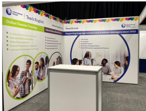
EXAMPLE IMAGE OF SEAMLESS GRAPHICS INSTALLED IN A 3M X 3M OPEN ENDED STAND.